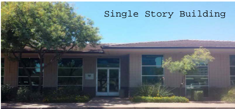
Single Story Building