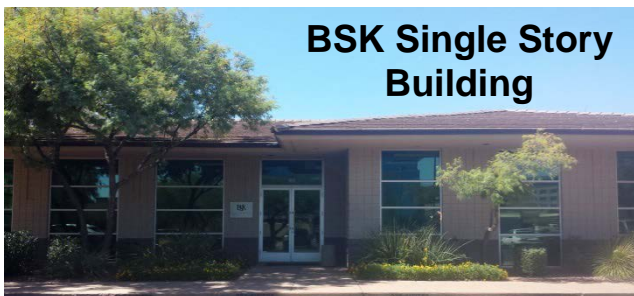
BSK Single Story Building